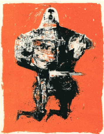
Fallen Warrior , 1957