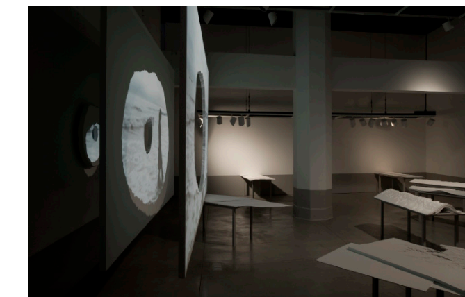
RIGHT: Installation view; vault with view into main gallery