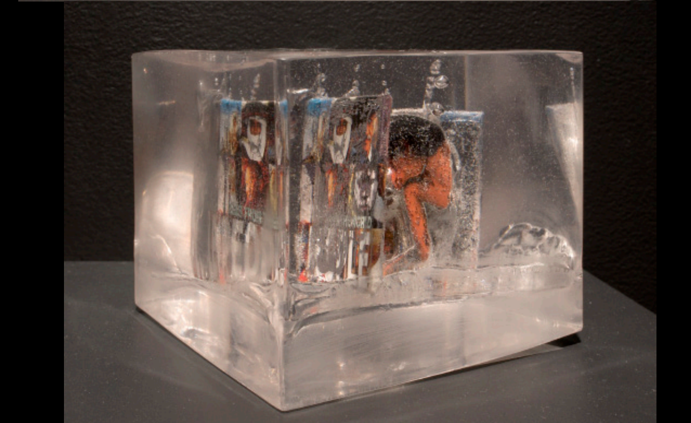
Noriko Ambe: Inner Water 1 MARCH—12 MAY 2012