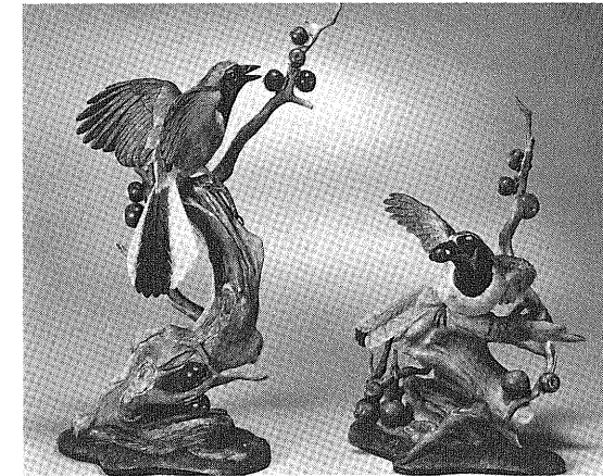
486 Green Jays with Persimmons Male: 18" x 12" Female: 14" x 10"