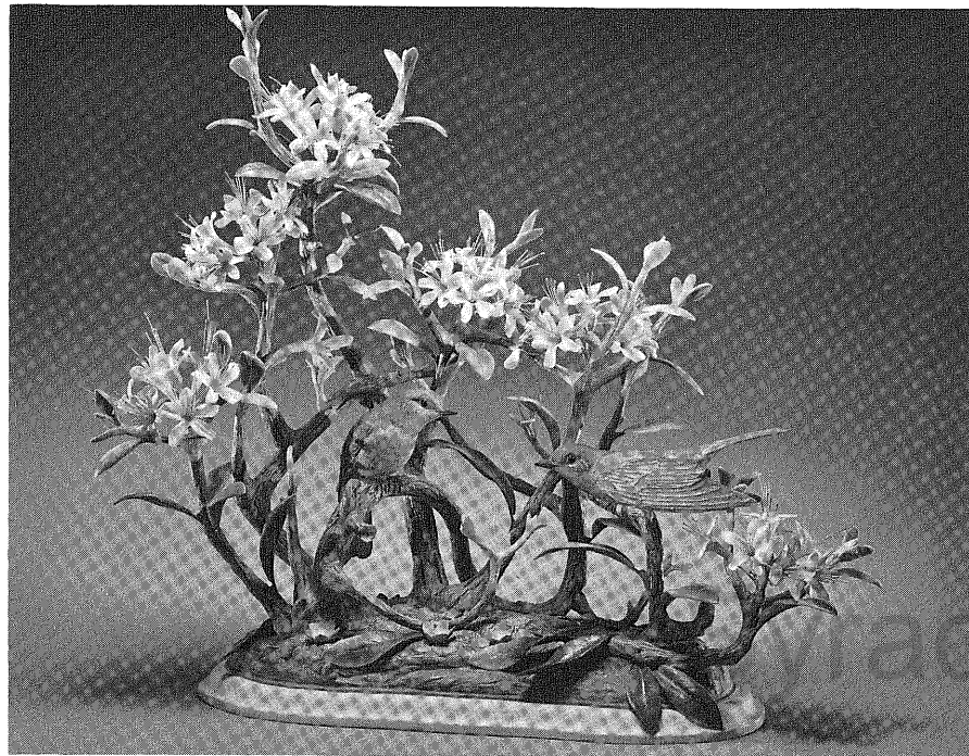
400-01 Western Bluebirds with Wild Yellow Azaleas 17½" x 20"